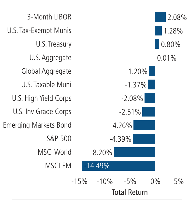
Figure 2: 2018 Index Total Returns

Source: Bloomberg, JP Morgan, Bloomberg Barclays, Payden Calculations